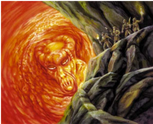
Word of Blasting

"Leaves more room for the big ones to fight in, you know." —Jaya Ballard, Task Mage